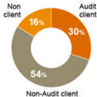
Fortune Global 500